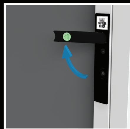
f. turn handle inward 90 degrees