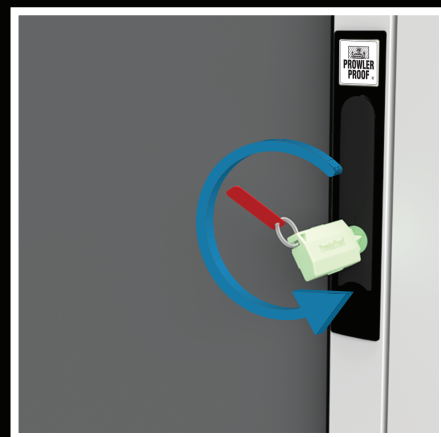
c. turn key to unlocked position (nearly 1 full turn until stops turning)