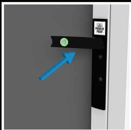
g. pull or push handle (pull-inswing window, push-outswing window) gently to open screen.