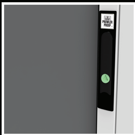
a. locked position

For non locking handle operation start from e. and lift handle out as shown.