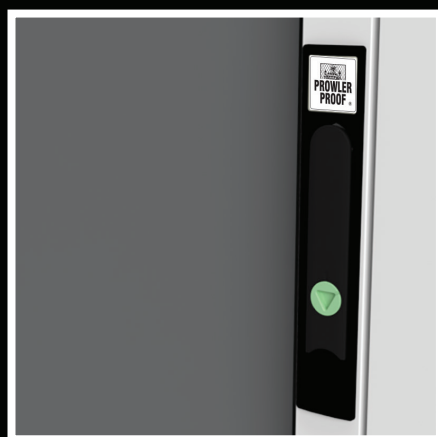
d. remove key when unlocked