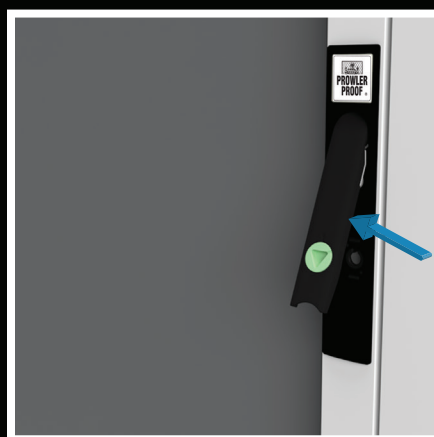
e. handle will pop-out or can be lifted