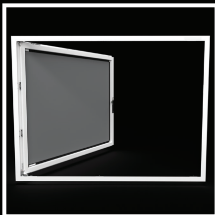
h. screen in open position