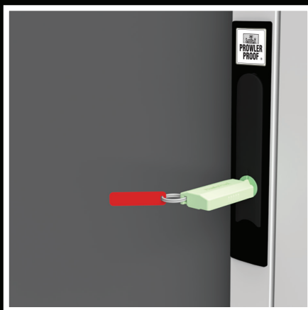
b. place key into position