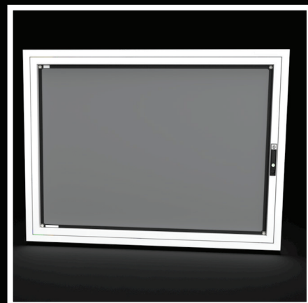
i. reverse order to close and lock