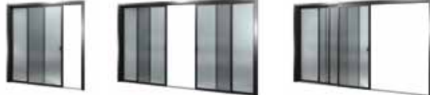
Single slider Double slider Stacking slider