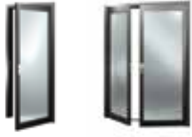
Single door French doors