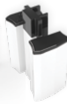
H Receiver - Conceal P06-71 Includes top and bottom caps.