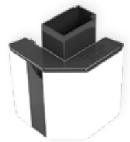
Corner Receiver - Conceal P06-072 Includes top and bottom caps.