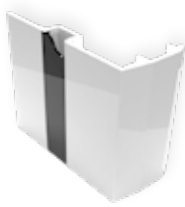
Interlock Stacking Conceal P06-058