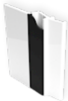
Interlock Stile P06-057