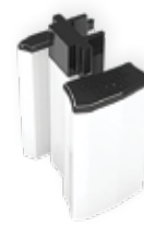
H Receiver - Slim Conceal P06-073 Includes top and bottom caps.